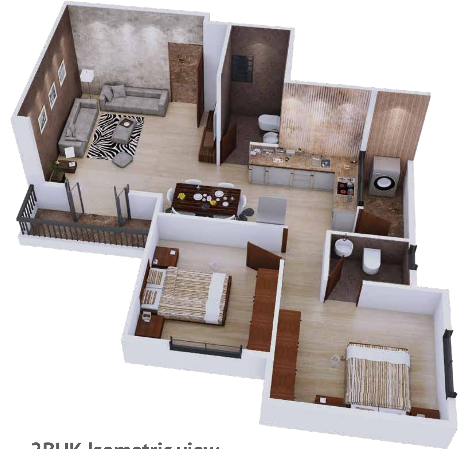
2BHK Isometric view